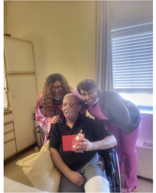
Our Community Events for our Veterans